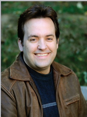
high-res cover & author images available